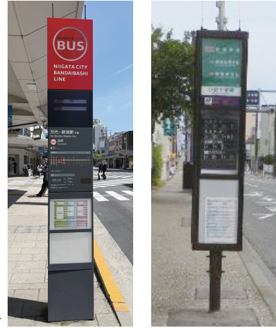
Example of a bus stop in the city▶

Check the destination and departure time and wait for the bus.