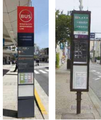
Example of a bus stop in the city▶

Check the destination and departure time and wait for the bus.